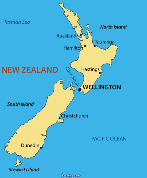
New Zealand map