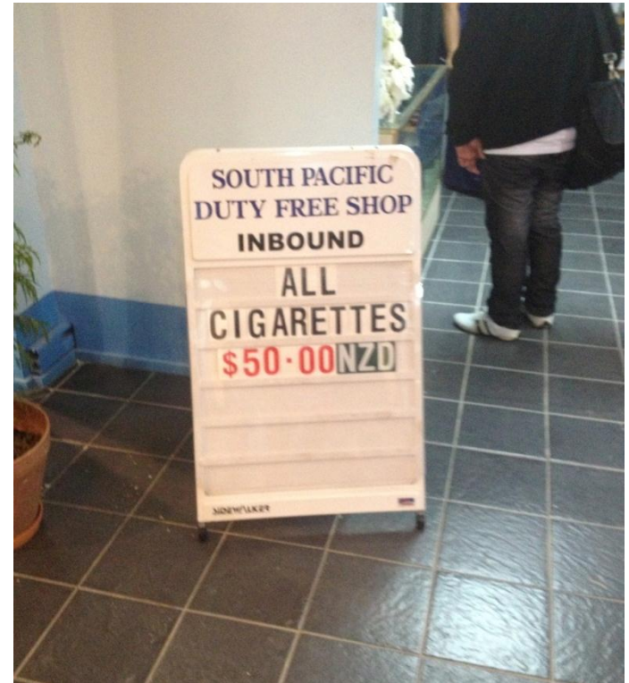
Duty-free shop at Faleolo Airport, Western Samoa