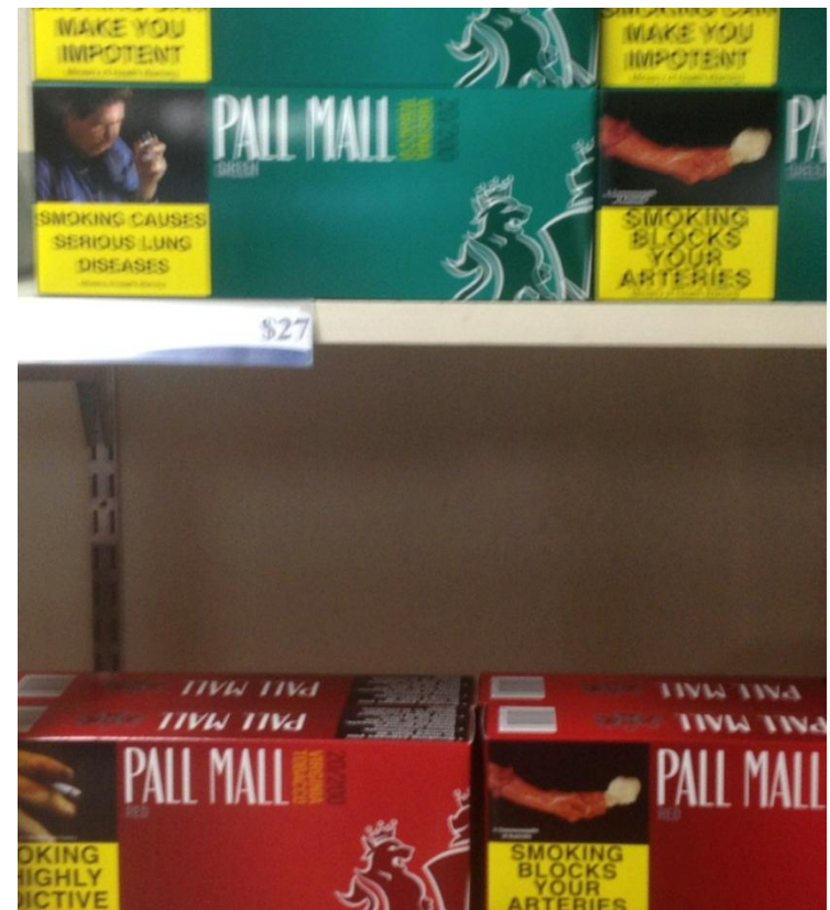
Duty-free shop at Rarotonga Airport, Cook Islands

“...easily available, easy to carry, always welcome, long-lasting, don't need to think about it, can be a last minute purchase, and are relatively cheap if purchased duty free”