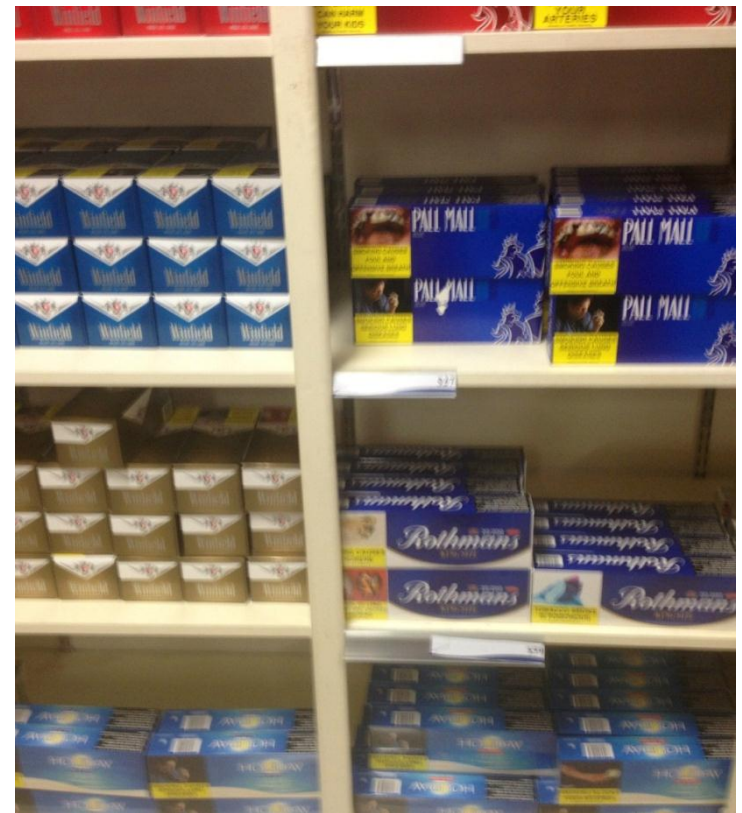
Duty-free shop at Rarotonga Airport, Cook Islands

P: "...about seven people last year around Xmas, who actually started smoking again because the people from Tonga bought all these duty-free smokes when they came for holidays.. there was so much abundance around them at faikava...they couldn't help themselves.