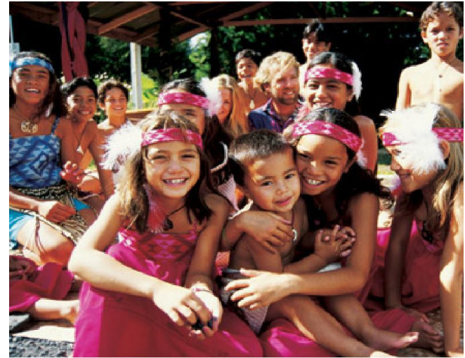
A Smokefree Aotearoa by 2025

P: "...It would make a big difference if you actually couldn't buy tobacco at duty free . It wouldn't put you under the pressure to buy the gift if you don't have that option because then your family knows that you can't... Yeah I think that would make a big difference just not having it as an option.