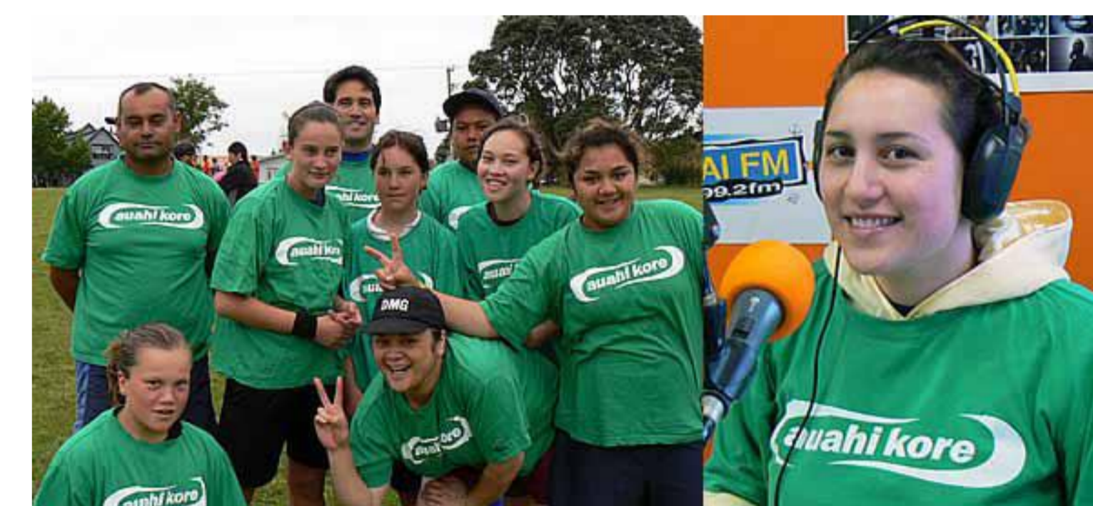
Fig. 2: Promoting "auahi kore" (smokefree in Māori language)

• Achieving <5% by 2025 requires net cessation rates of 10% for non-Māori and 20% for Māori with halving or quartering of initiation rates (Fig 1)