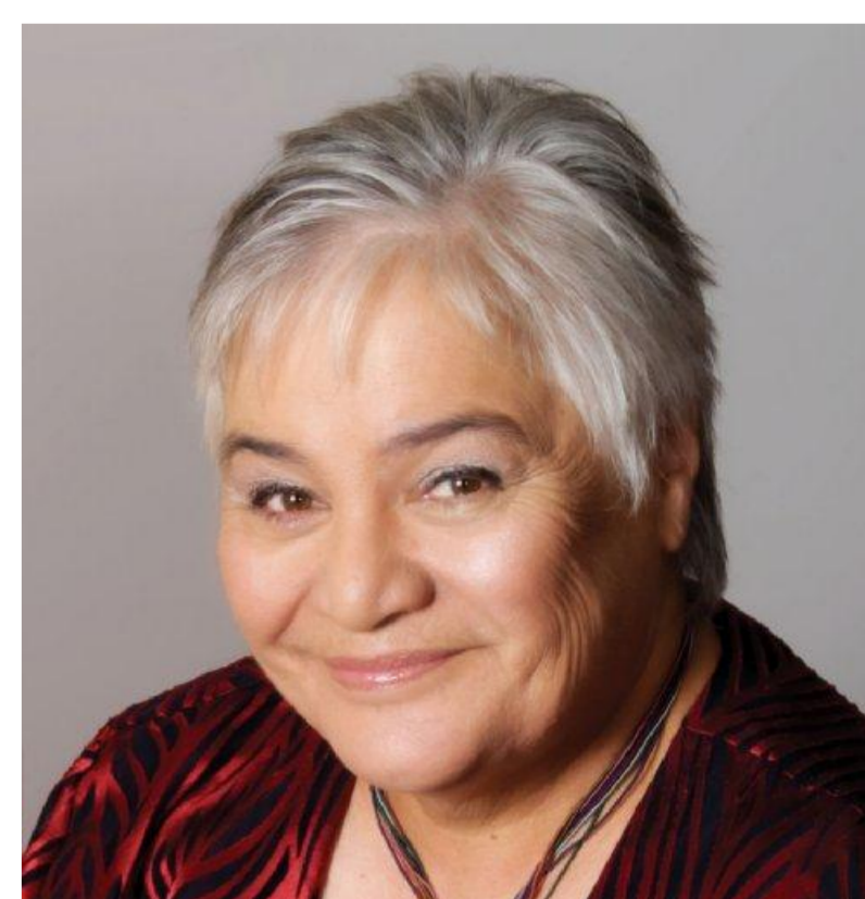
Fig. 3: Tariana Turia, Associate Minister of Health & Māori Party Leader

While the smokefree goal (<5% by 2025) appears feasible for NZ, greatly increased cessation rates would be required, particularly for Māori. Intensified established tobacco control interventions such as higher tobacco taxes will definitely be needed, possibly along with major endgame strategies.